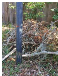
Debris along path